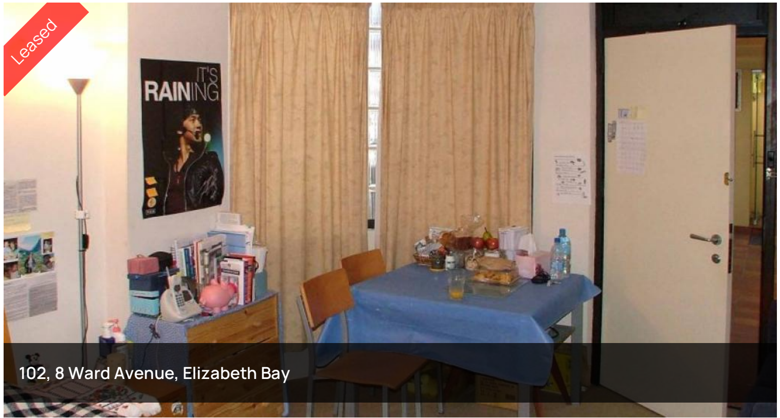
102, 8 Ward Avenue, Elizabeth Bay